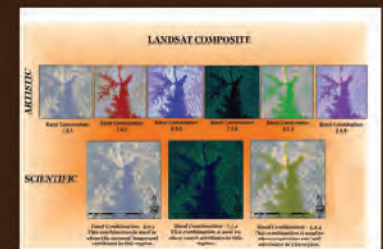
SATELLITE IMAGERY INTERPRETATION AND DESIGN

JOIN US AS A GEOGRAPHY MAJOR OR MINOR STUDY THE DYNAMIC WORLD AROUND US IN ALL ITS RICH ENVIRONMENTAL AND CULTURAL DIVERSITY. COME MEET WITH US IN THE GEOGRAPHY PROGRAM DEPARTMENT OF POLITICAL SCIENCE RHODE ISLAND COLLEGE