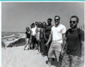
GLACIOLOGY OF NAPATREE POINT, WATCH HILL, RI

IN ADDITION TO THE TRADITIONAL CLASSROOM, MANY GEOGRAPHY COURSES OFFER THE OPPORTUNITY TO VISIT THE 'LIVING CLASSROOM' OF THE OCEAN, BAY, NUTMEG, EMPIRE & GARDEN STATES