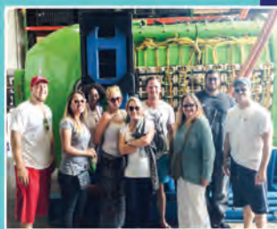
TOOLS FOR EXPLORING THE OCEAN DEPTHS WOODS HOLE OCEANOGRAPHIC INSTITUTION