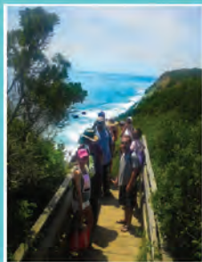
COASTAL EROSION AND BEACHES AT MOHEGAN BLUFFS BLOCK ISLAND, RI