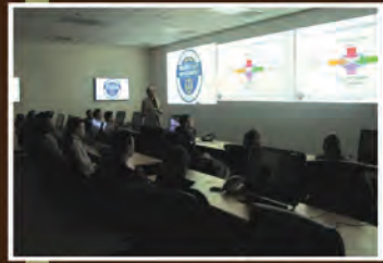
RHODE ISLAND EMERGENCY MANAGEMENT AGENCY