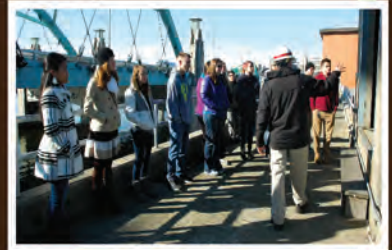
FOX POINT HURRICANE BARRIER