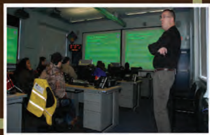
PROVIDENCE EMERGENCY MANAGEMENT AGENCY