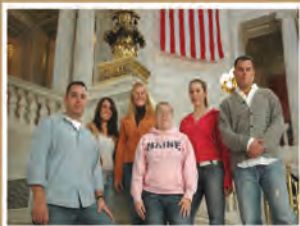
RHODE ISLAND STATE HOUSE