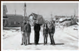
HURRICANE SANDY DEVASTATION IN NEW JERSEY

APPROACHES TO EMERGENCY MANAGEMENT AND DISASTER PREPAREDNESS AROUND THE WORLD, WITH NUMEROUS LOCAL FIELD WORK AND SITE VISIT OPPORTUNITIES. STUDENTS ARE ENCOURAGED TO EARN ON-LINE CERTIFICATIONS OFFERED BY FEDERAL AGENCIES