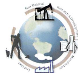
LIFE CYCLE OF PETROCHEMICAL CLEANERS 10,000 YEARS

The earth offers a wealth of sustainable raw materials that possess natural and powerful cleaning abilities. Genesan harnesses this power in our high performance, biobased products; safer, effective and economical alternatives to petro-chemically based products.