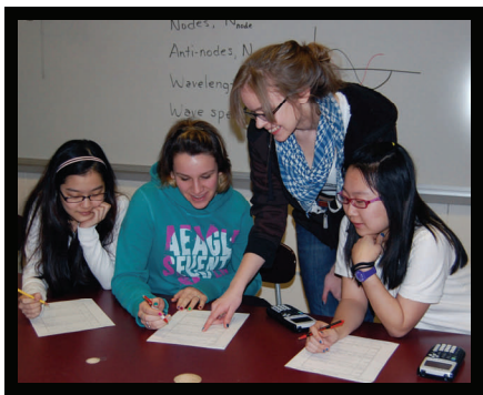
Physics 101 class /St. Mary Academy, Bay View

For more information, check the Open Books, Open Minds website http://ric.edu/obom/ .