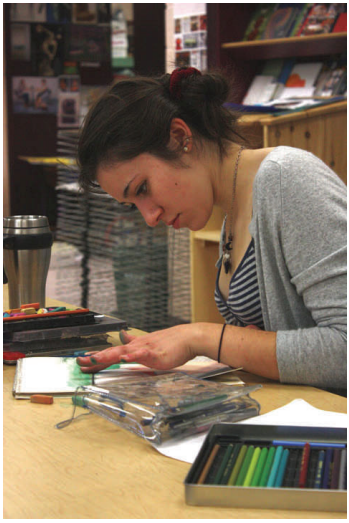
South Kingstown HS/ Art 201 Student

Equally as exciting is that RI voters approved a $17M bond issue to help support the renovation and the expansion of the Art Center on campus. Here is a rendering of the center, scheduled for completion in 2012: