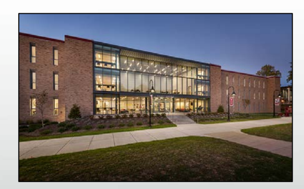
Gaige Hall Renovation (Capital Budget )