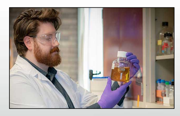
Biology Department (Annual Operating Budget)