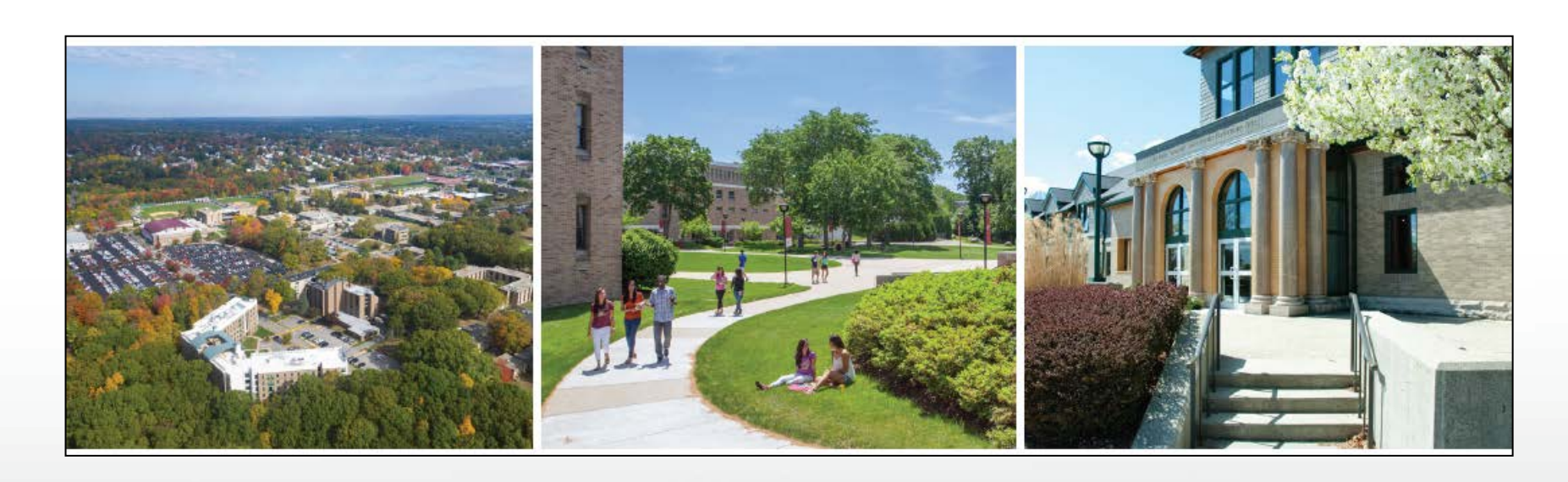
November 21 & December 2