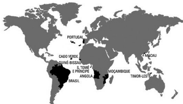
Countries in which Portuguese is spoken