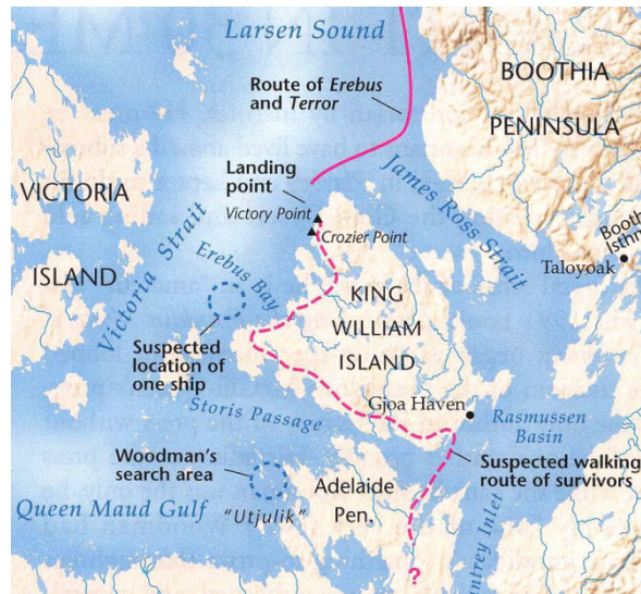
Fig. 1 Franklin Area showing abandonment position and possible wreck locations. Erebus was found in 2014 just south of the indicated "Woodman's search area". Royal Canadian Geographical Society

Clues that could lead to the location of the Terror are largely embedded in stories of visits made by various Inuit hunters to Franklin's ships. Most historians either doubt that these visits occurred, or conclude that they refer to the period before the known abandonment of April 1848, when the ships were still together off the northwest shore of King William Island.