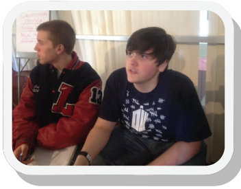
Members of the “press” asking questions of President Johnson’s cabinet members